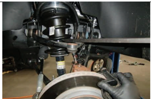
Lift suspension slightly while prying down to attach ball joint.