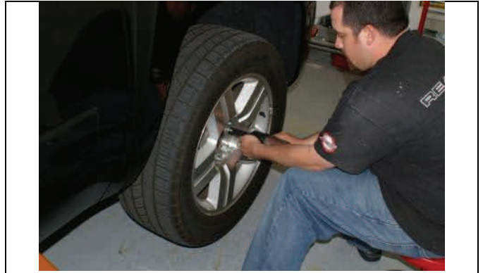
Remove front wheels/tires