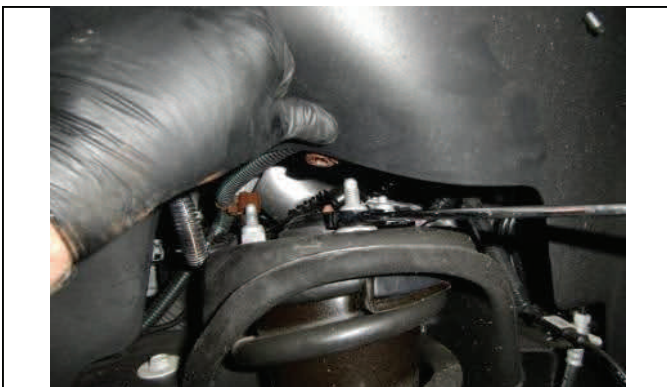
Remove upper strut mounting nuts