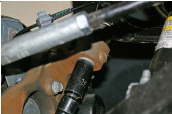
Tighten upper ball joint to spec.