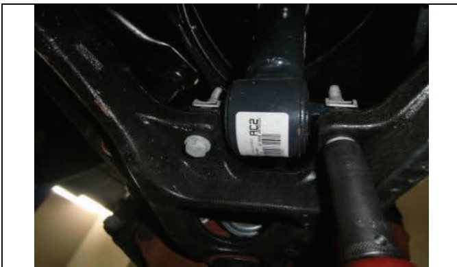
Remove lower strut mounting bolts