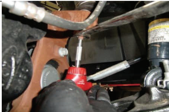
You may need to hold stud with hex key while tightening