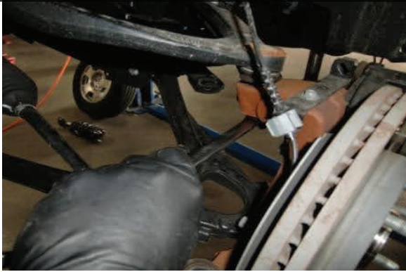
Loosen upper ball joint nut and leave attached.

Reinstall strut assembly in vehicle with the new provided hardware on top and the OE fasteners at the lower mount. Reattach the sway bar end links and ABS/brake line bracket. Note: Vehicles installing 66-3085 with the lower strut spacer perform the following steps to complete installation.