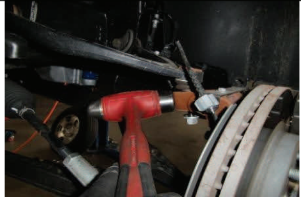
Carefully strike spindle as shown to separate ball joint.