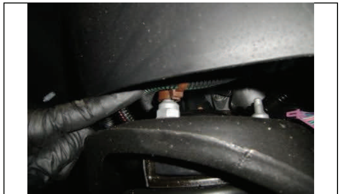
Pry up ABS retaining clips from upper strut mounting nuts