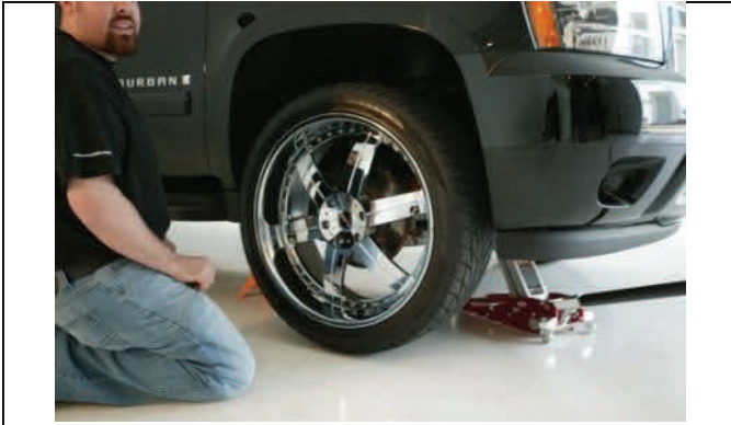
Raise and support front of vehicle frame on jack stands