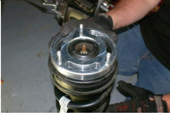
Place strut extension spacer on top of strut

Reinstall strut assembly in vehicle with the new provided hardware on top and the OE fasteners at the lower mount. Reattach the sway bar end links and ABS/brake line bracket. Note: Vehicles installing 66-3085 with the lower strut spacer perform the following steps to complete installation.