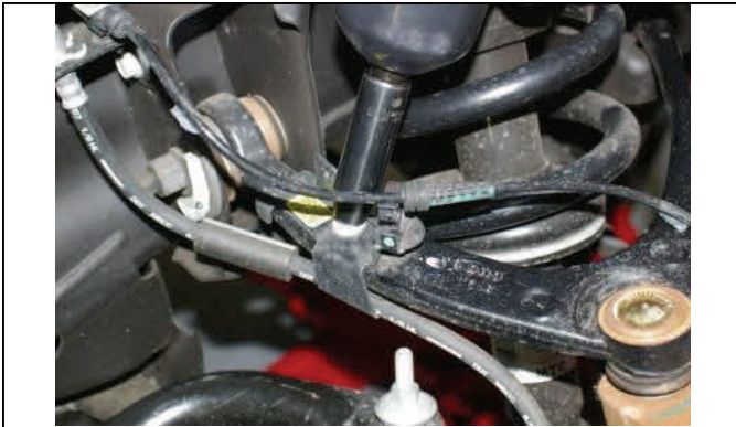
Disconnect ABS/brake bracket from upper control arm.