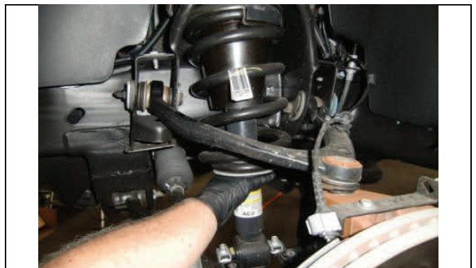
Remove entire strut assembly from vehicle.