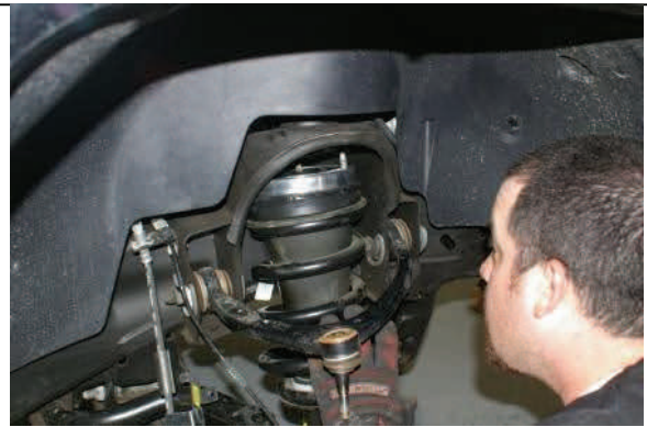
Lower suspension slightly and reinstall strut assembly