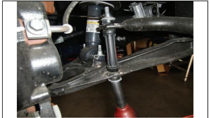
Disconnect dr/pass sway bar end links