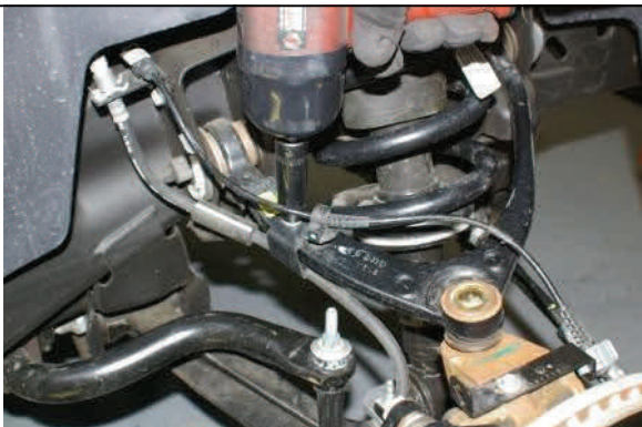
Reattach ABS/brake line bracket and sway bar end links

Reinstall wheels/tires and torque to spec. Re-check all work performed, test drive and have vehicle aligned.