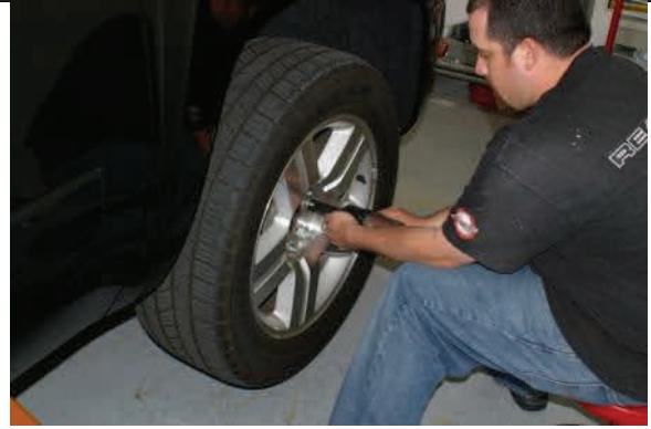
Remove front wheels/tires