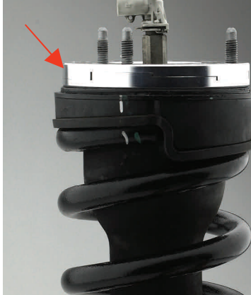
Figure 4 A-C = 1" at the wheel