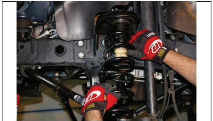
Carefully lower front axle enough to remove front spring