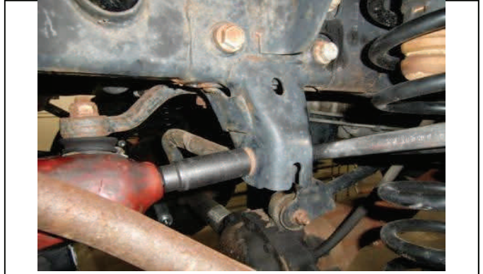
Support front axle and remove upper trac bar bolt.