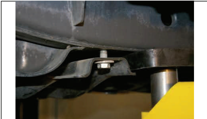
Loosen (2) front transfer case skid plate bolts.