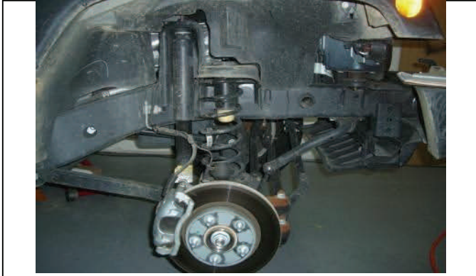
Securely raise vehicle off ground and remove (4) wheels