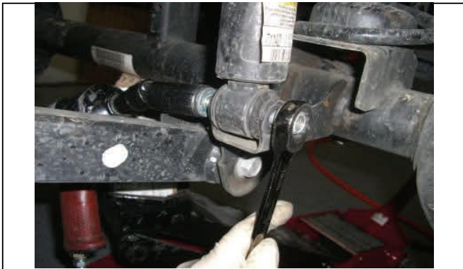
Disconnect and remove front lower shock hardware.