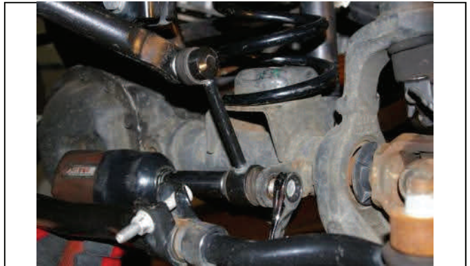
Disconnect dr./pass. lower front swaybar end links