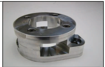
Config. C = 2.0" Lift

Assemble the desired amount of lift ( 1.0", 1.5", 2.0" ) based on the vehicle's stance.